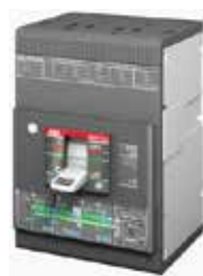
XT2 - XT4